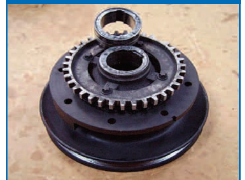
Figure 2: Broken crank balancer and reluctor.

After a new balancer and an oil change, the Windstar ran great, rattling cat and all. But with the engine's normal torque restored, we could clearly hear a nasty rod knock. Good thing we didn't throw a bunch of parts at it.